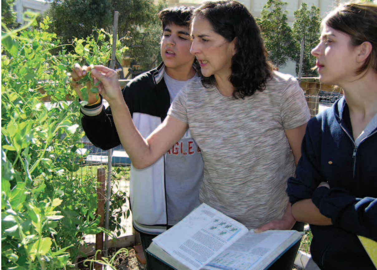
California Department of Education

Below are a few ideas for life, physical, and earth science activities in the classroom garden.