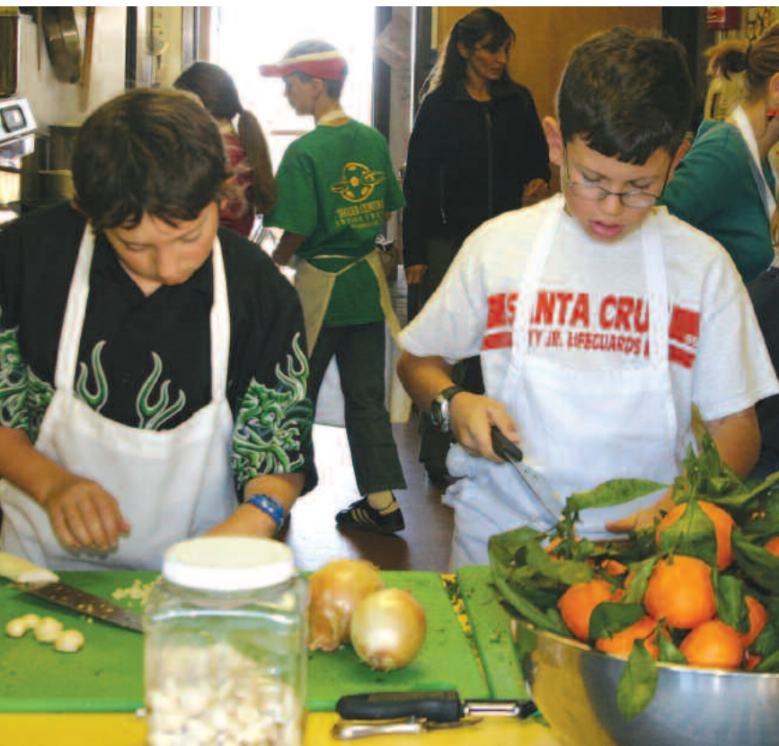
Alicia Dickerson/Life Lab

These ideas are just a sampling of the classroom gardening activities available to you. Search books, magazines, and Web sites for additional ideas. Also, as you grow with your garden, you will create many activities of your own. Be sure to pass them along to other teachers and parents.