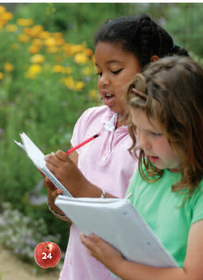
Western Growers Charitable Foundation