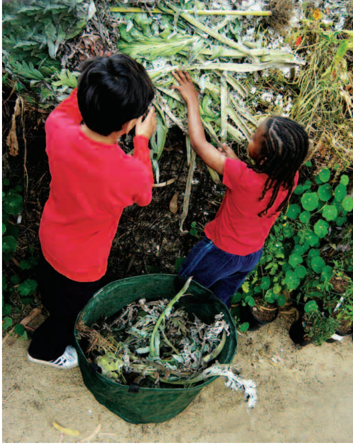
Western Growers Charitable Foundation

Outdoor gardens benefit from the addition of 2 to 3 inches of mulch on top of the soil. The mulch helps to slow water loss from evaporation, moderate soil temperatures, decrease soil erosion, and decrease the spread of soilborne diseases. You can use a number of different materials as mulch, including shredded wood, leaves, straw, plastic, and newspaper. The various mulches offer different benefits. For instance, organic mulches (shredded wood, leaves, or straw) will eventually break down and help improve soil structure. Plastic mulches will increase the soil temperature. Choose mulch according to your plants' needs, mulch availability, and visual preferences.