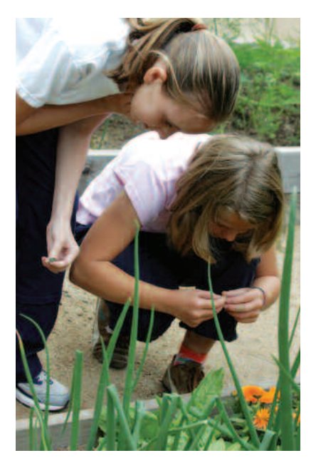
Western Growers Charitable Foundation