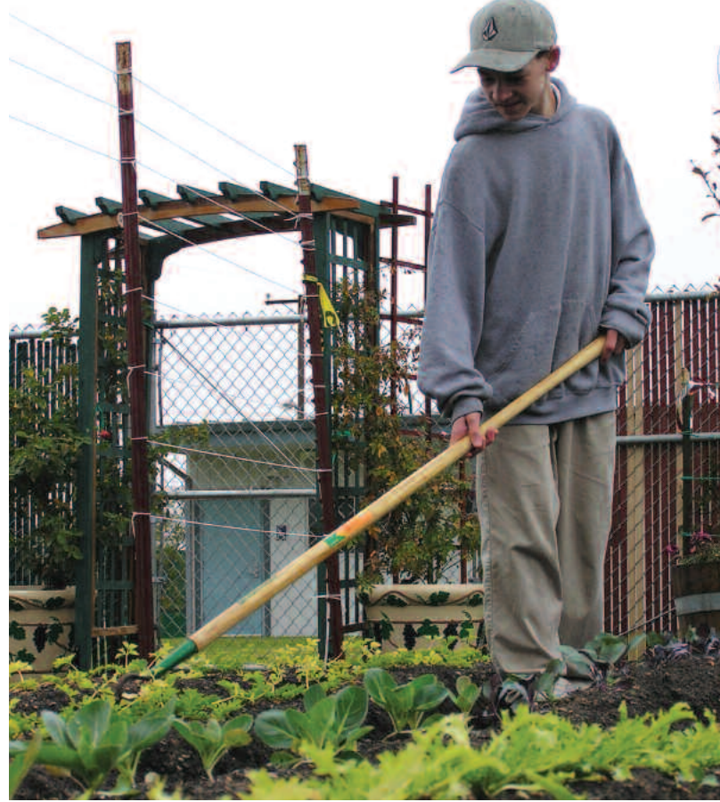
California Department of Education

This chapter provides background information on some of the techniques your team will employ to maintain the garden, along with an overview of seasonal garden tasks. It concludes with tips for dealing with such common challenges as how to maintain the garden during summer breaks and how to deal with vandalism.