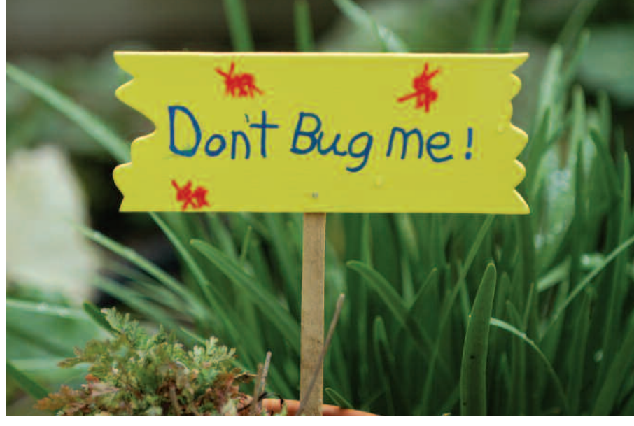
Western Growers Charitable Foundation

Gardens for Learning: Maintaining Your School Garden