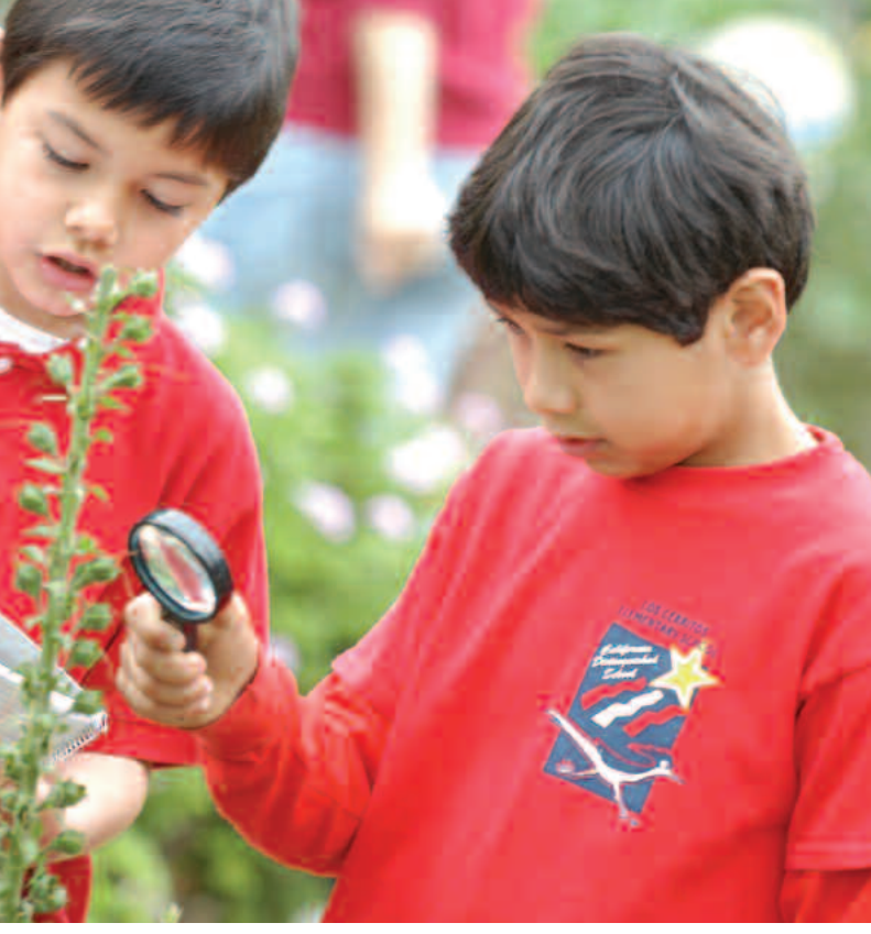
Western Growers Charitable Foundation

Use mulch. A thick layer of mulch reduces weed growth, maintains soil moisture, and enriches the soil as it decays. In vegetable and annual beds, use inexpensive organic mulch such as newspaper topped with straw. In perennial beds, add a 2- to 3-inch layer of more durable organic mulch, such as shredded bark.